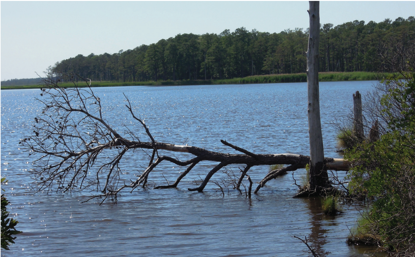
Gradual inundation and loss of forests and farmlands on the Chesapeake Bay (U.S.). It is projected that over 40,000 acres of agricultural lands, forests, and wetlands will be lost in the next 25 years with the encroachment of saline waters.

The three concepts are also intertwined with the questions of adaptation and development. They have proved important in our understanding climate change effects, but as yet have failed to produce widely adopted policies or practices that have significantly reduced greenhouse gas emissions, or risk, or losses from climate change in much of the world. A growing number of anthropologists advocate that we must look for solutions which generate policies that creatively articulate multiple perspectives among global actors on the causes, effects, adaptations, resiliencies and vulnerabilities associated with climate change that are embedded in global, national and local priorities and practices of development.