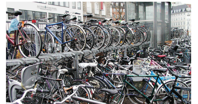
Nearly 30 percent of Dutch commuters always travel by bicycle, and an additional 40 percent sometimes bike to work.

Reshaping the relationship between people and their carbon-intensive lifeways entails a shift in habitus, and anthropology is the appropriate discipline to both document and support such transitions.