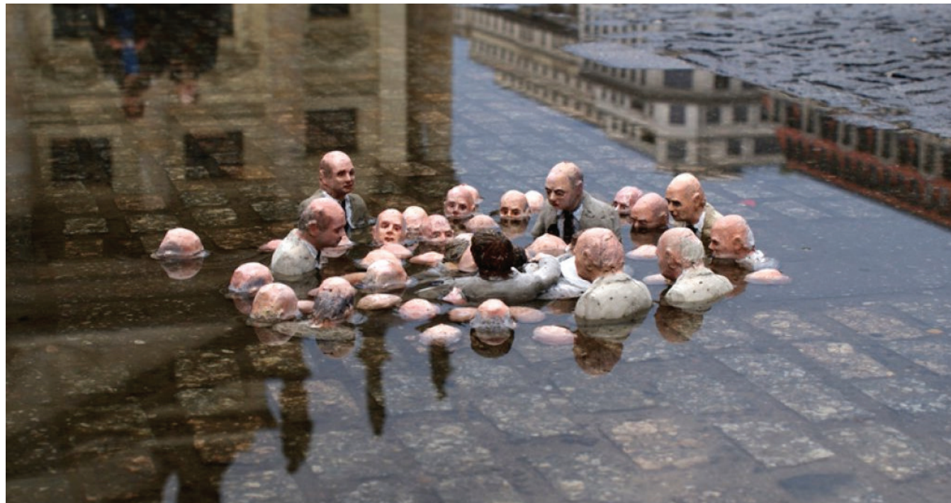
“Electoral Campaign” art installation in Berlin, 2010.

Climate change drivers are highly diverse and complex. In order to halt climate change and develop sustainable adaptive strategies for the future, a systems approach linking people, the environment, and the economy is valuable. Systems thinking forces us to identify drivers and impacts with new specificity, to examine non-linear associations, to engage with new concepts, methods, and models that bridge many disciplines. Anthropology adds a holistic view of human society to the interdisciplinary toolbox and a substantive record of understanding human-environmental interaction over the long term.