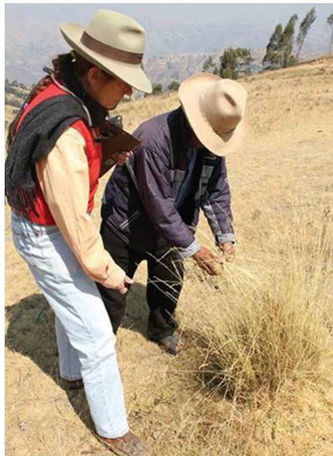
Peruvian elder explains medicinal plant uses with regional anthropologist.

Anthropologists study a number of linkages between human and natural systems. Of particular importance are the human activities that generate greenhouse gases, the ways in which different groups perceive and understand climate change, the varying impacts of climate change on people around the world, and the diverse societal mechanisms that drive adaptation and mitigation. In short, we need to use qualitative approaches to understand fully how humans interact with a complexity of change in the contemporary world.