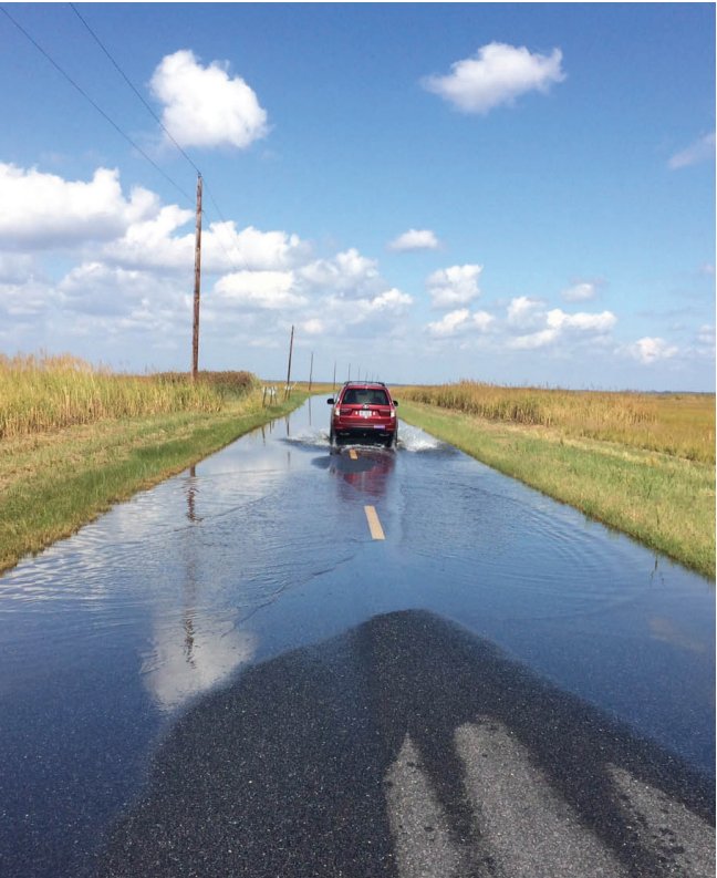
The new normal. Flooding of coastal infrastructure and croplands in low-lying areas.