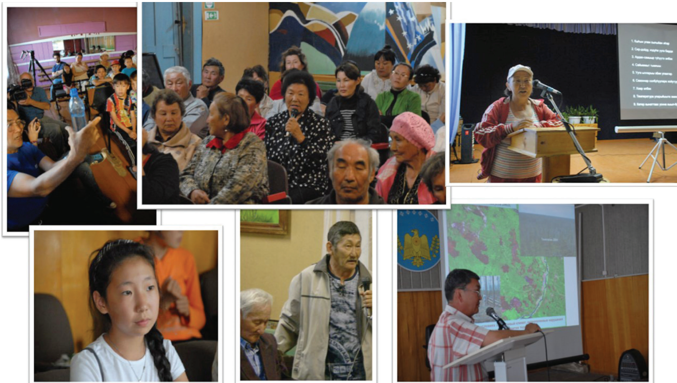
Siberian Sakha communities exchange local and scientific knowledge on local climate change effects.

Communities are comprised of diverse individuals and are therefore intrinsically heterogeneous and are commonly divided according to demographic and socioeconomic characteristics, such as gender, economic status, education, or ethnicity. Anthropologists engaging in climate research recognize the diversity of different perspectives within communities on approaches to climate change. Thus, anthropologists often see multiple, overlapping groups that are relevant in engaging communities in climate. Anthropologists also examine the cross-scale links that run through communities, from individuals and households on up to international NGOs, and among communities that may be widely dispersed across the globe such as the Alliance of Small Island States—an entity that gives small island nations around the world a united voice at the UN.